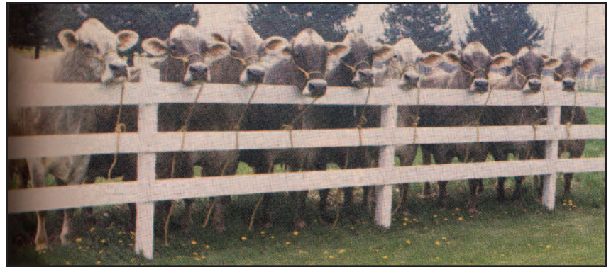
Neva and Neda and their 7 natural offspring in 1984.

Blessing Farms, truly an all-round breeding program.