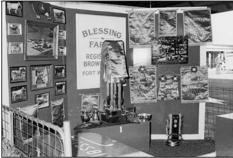
Blessings' booth at World Dairy Expo.